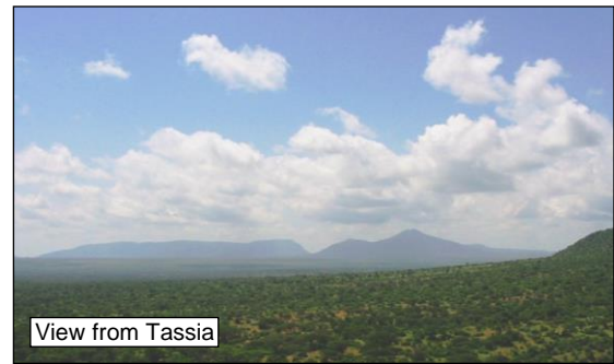
View from Tassia